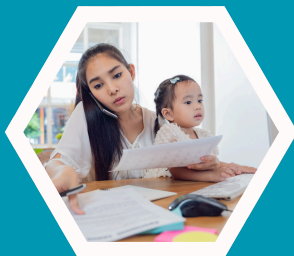
Childcare slots available for employees of local businesses, supporting a balanced work-life environment for parents.