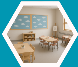
Spacious, well-equipped classrooms designed for each stage of early development.