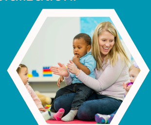
A commitment to living wages for our qualified early childhood educators, ensuring staff stability and high-quality care for children.