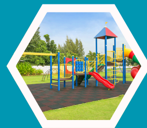
A secure outdoor inclusive play area to encourage physical activity and socialization.