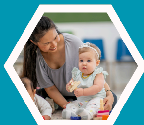
Tuition assistance and subsidized slots for families in need, promoting equal access to quality childcare.